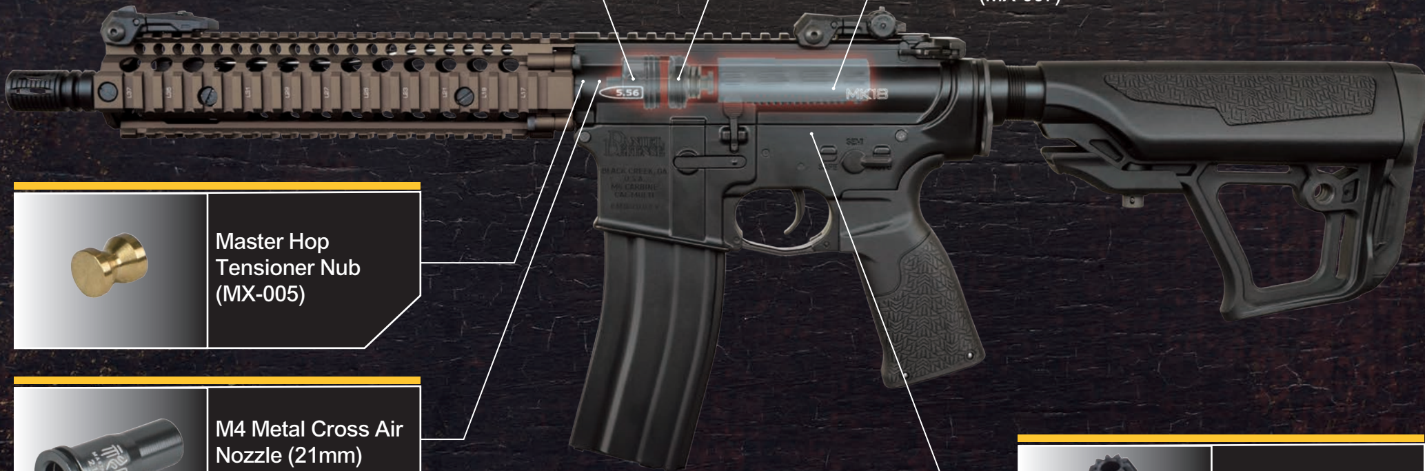
Full Steel Teeth Piston (MX-007)