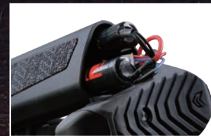
Enlarged battery compartment