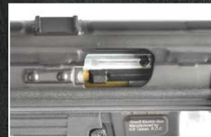
Pull Back Charging Handle

Charging handle can be locked to adjust the H-UP.