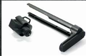
made by SPCC

The CES-P retractable stock rods are made by SPCC. It is sturdy, durable, and still can survive after intensively operated. The stock butt plate is made with wrapping injection process to reproduce the same manufacturing procedure of the real steel.