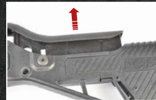
3-level cheek rest

The S.F.S Stock System is featured with a rapid adjustable 3-level cheek rest and a 4-length adjustable and foldable stock. The total length of the replica can be significantly reduced after folding the stock, ideal for using in narrow spaces.